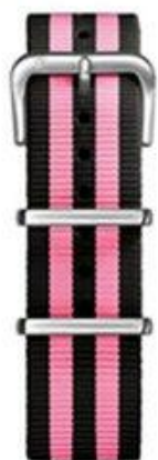
Black / pink