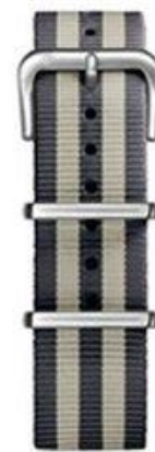
Anthracite / Ivory