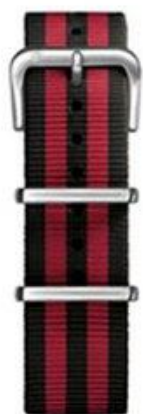
Black / red