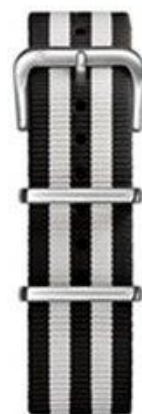
Black / White