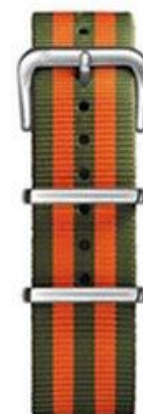
Kaki / Orange