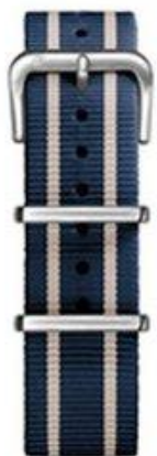
Navy / Ivory / Navy