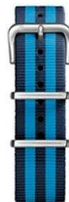
Navy / Turquoise