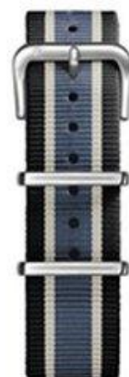
Black Ivory Jean