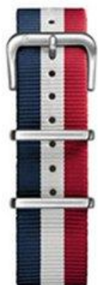
Navy / White / red