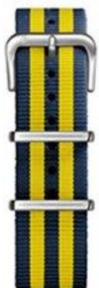
Navy / yellow