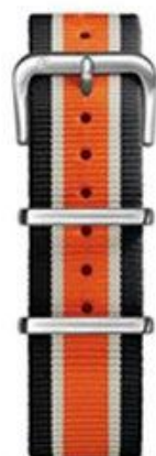
Black Ivory Orange