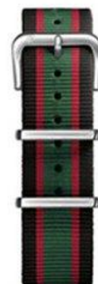
Black / green / red